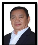
Rodolfo Abellana Vocational Service